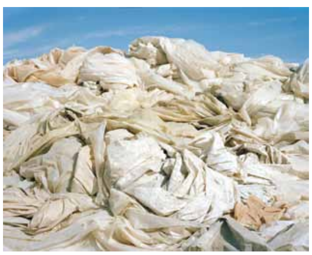
©Corinne Silva Plastic Mountain I , plastic recycling plant, from the series Badlands , 2008-11