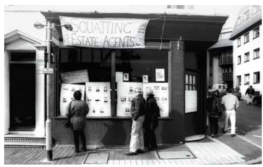
Top: © Alec Smart Ideal Squat Exhibition homelessness protest, Brighton, 1994 © Alec Smart The Squatters' Estate Agency, homelessness protest, Brighton, 1997