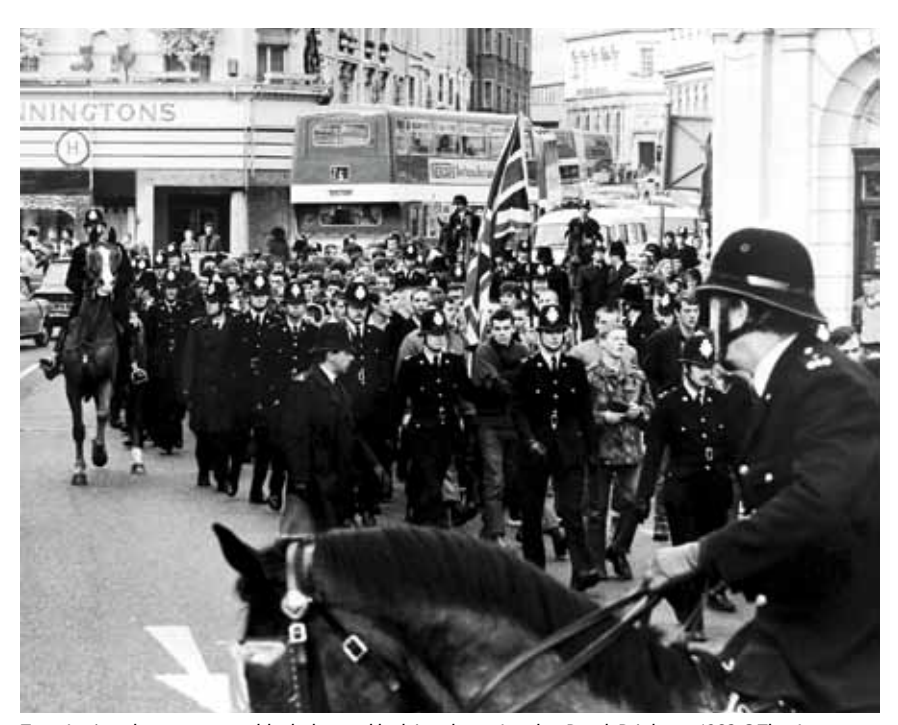
Top: Anti nuclear protestors \ block \ the \ road \ by \ lying \ down, London \ Road, \ Brighton, \ 1982 \ @The \ Argus. The \ far-right \ National \ Front \ march \ through \ Brighton, \ Castle \ Square, \ Brighton, \ 1981 \ @The \ Argus.