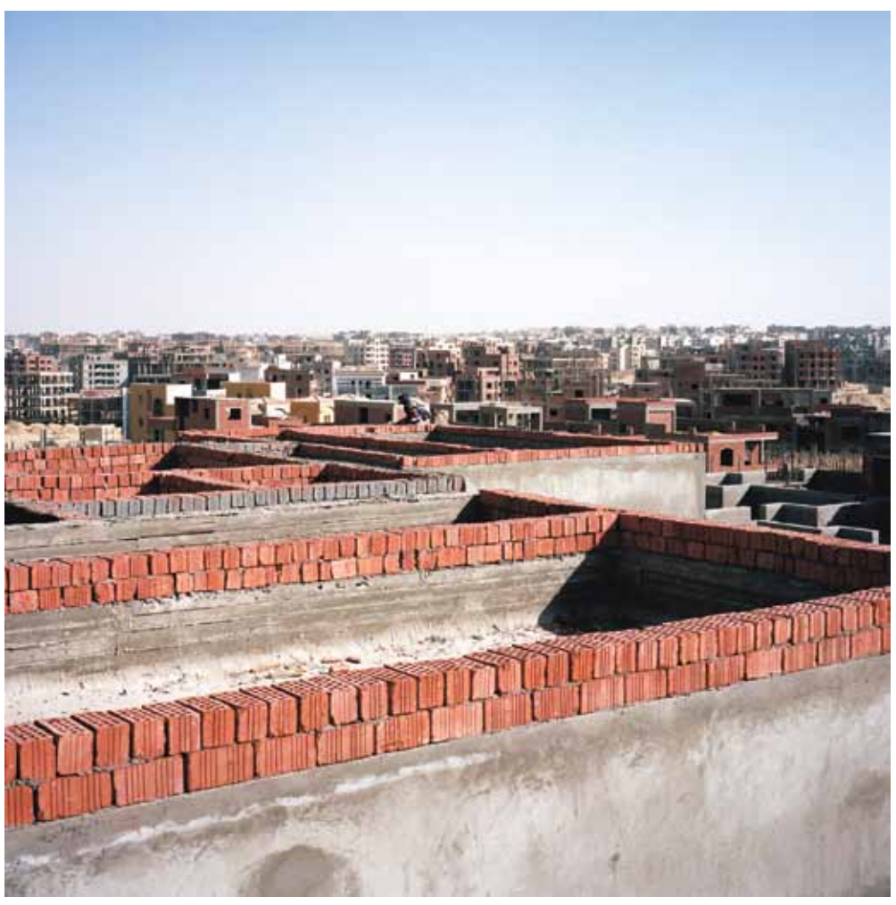
© Jason Larkin Untitled (#2), Cairo Divided, 2011