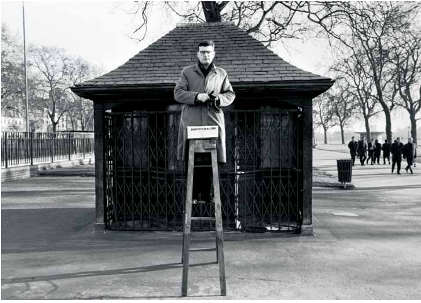
Above: Free Speech at Speakers' Corner, London Below: Committee of 100 arrested at Ruislip, London, 1964.