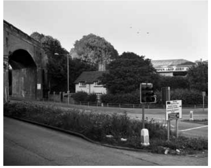
Previous Page: ©Jamie Hawkesworth, from Four Versions of Three Routes, by Preston is my Paris, 2012 Top: ©Theo Simpson, from Four Versions of Three Routes, by Preston is my Paris, 2012

B AROUND THE CITY and at BARTHOLOMEW SQUARE, BRIGHTON, BN1 1JS