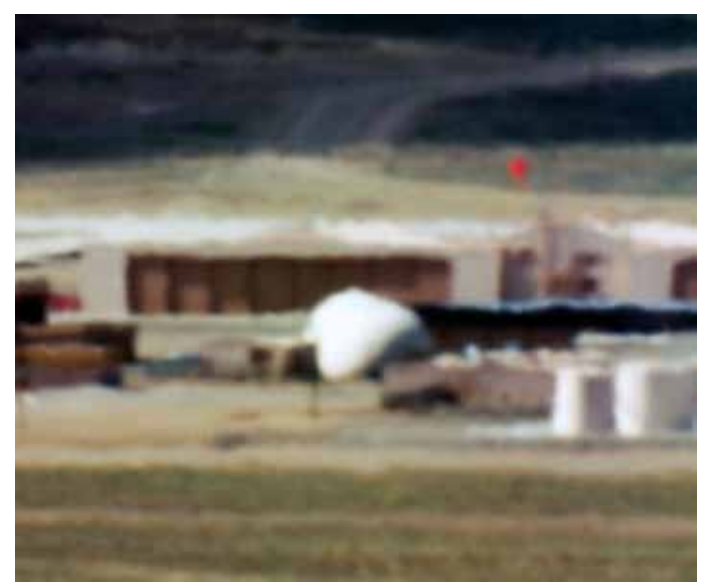
Above: ©Trevor Paglen, Large Hangars and Fuel Storage, Tonopah Test Range, Nevada, distance 18 miles, 10:44 am, 2005 Opposite: ©Trevor Paglen, KEYHOLE/IMPROVED CRYSTAL Optical Reconnaissance Satellite Near Scorpio (USA 129), 2007.