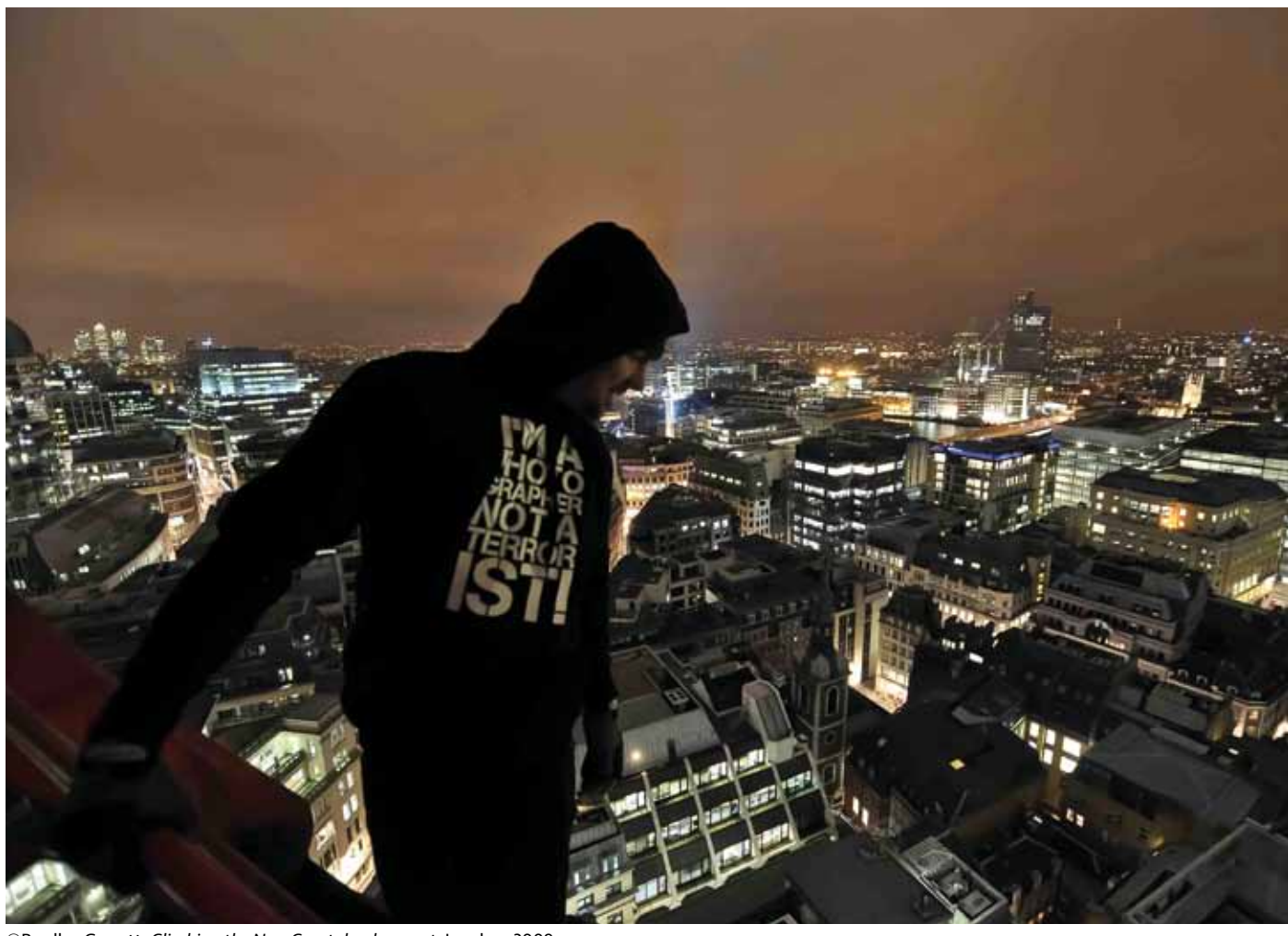
Climbing the New Court development, London, 2009